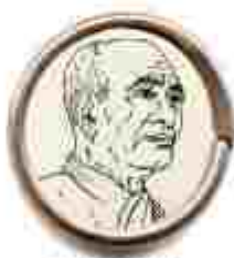
Vallabhbhai Jhaverbhai Patel

(1875-1950) born Gujarat. Minister of Home, Information and Broadcasting in the Interim Government. Lawyer and leader of Bardoli peasant satyagraha. Played a decisive role in the integration of the Indian princely states. Later Deputy Prime Minister.