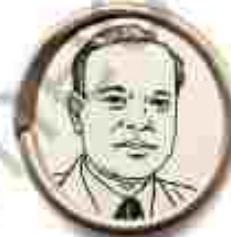
Jaipal Singh (1903-1970) born Jharkhand. A sportsman and educationalist. Captain of the first national Hockey team. Founder President of Advesh Maha Sabha. Later founder of Jharkhand Party.