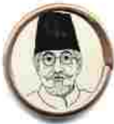
Abul Kalam Azad

(1875-1950) born Gujarat. Minister of Home, Information and Broadcasting in the Interim Government. Lawyer and leader of Bardoli peasant satyagraha. Played a decisive role in the integration of the Indian princely states. Later Deputy Prime Minister.