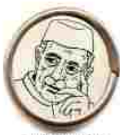
Jawaharlal Nehru (1889-1964) born: Uttar Pradesh. Prime Minister of the interim government. Lawyer and Congress leader. Advocate of socialism, democracy and anti-imperialism. Later: First Prime Minister of India.