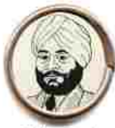
Baldev Singh (1901-1961)

born: Haryana A successful entrepreneur and leader of the Panthic Akali Party in the Punjab Assembly. A nominee of the Congress in the Constituent Assembly. Later: Defence Minister in the Union Cabinet.