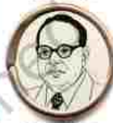
Bhimrao Ramji Ambedkar

(1887-1971) born Gujarat. Advocate, historian and linguist. Congress leader and Gandhian. Later Minister in the Union Cabinet. Founder of the Swatantra Party.