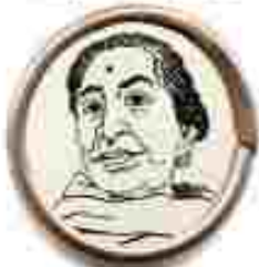
Sarojini Naidu (1879-1949) born: Andhra Pradesh. Poet, writer and political activist. Among the foremost women leaders in the Congress. Later: Governor of Uttar Pradesh.