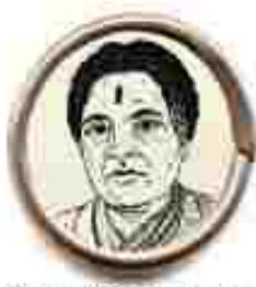
G. Durgabai Deshmukh (1909-1981)

born: Andhra Pradesh Advocate and public activist for women's emancipation. Founder of Andhra Mahila Sabha, Congress leader. Later: Founder Chairperson of Central Social Welfare Board.