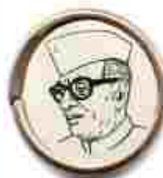
Kanhayalal Maniklal Munshi

Constituent Assembly at the stroke of midnight on 15 August 1947: