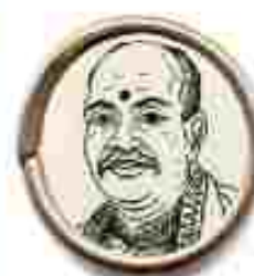
Shyama Prasad Mukherjee

(1891-1956) born Madhya Pradesh. Chairman of the Drafting Committee. Social revolutionary thinker and agitator against caste divisions and caste-based inequalities. Later, Law Minister in the first cabinet of post-independence India. Founder of Republican Party of India.